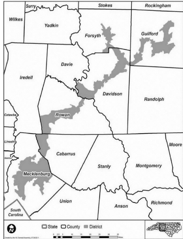
Congressional District 12 (Enacted 2011)

¶121 The United States Supreme Court described Congressional District 1 as "anchored in the northeastern part of the State, with appendages stretching both south and west[.]" Id. at 1456. It described District 12 as "zig-zagging much of the way to the State's northern border." Id. District 1 had a